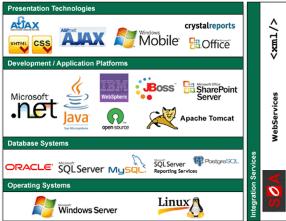
Our Technology Base