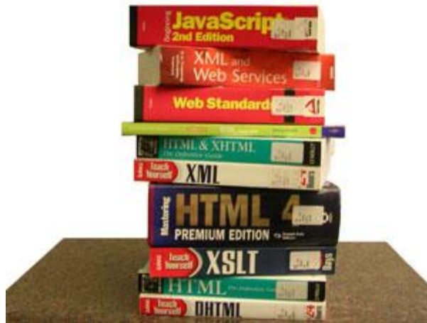
Rapidsoft's knowledge oriented R&D culture