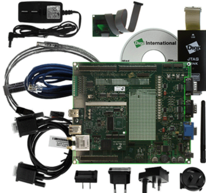
Tools for Hardware Product Design