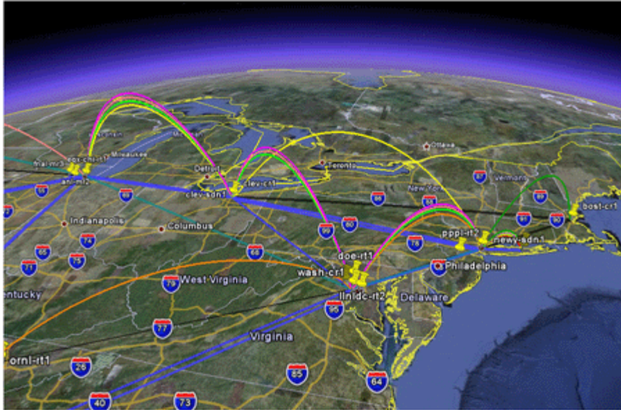
A Typical Network Lay Out for a Complex Multi City Delay Sensitive Network Installation