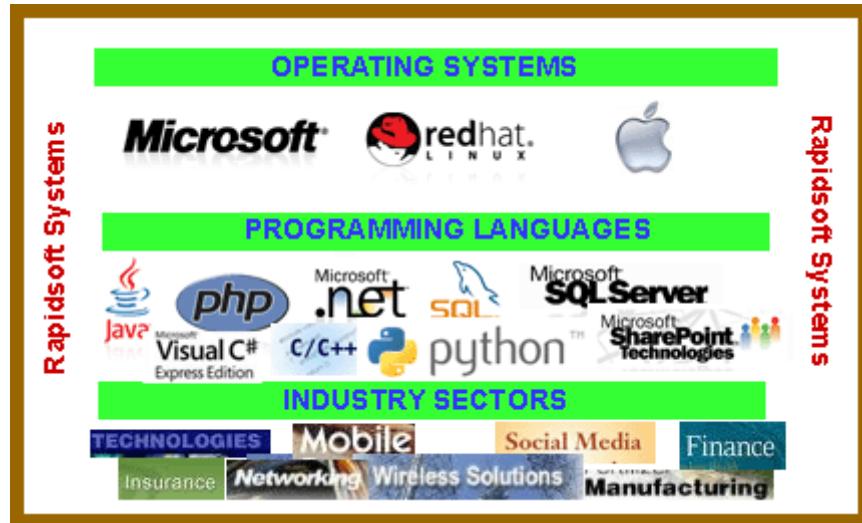
Sample Software Applications Technologies and Sectors

Our suite of Application Development Service offerings include: